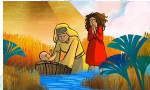
The Story of the Baby Moses Exodus 2:1 - 10:

Find out how these stories depict love. Share with your family at home or with your teachers in school: