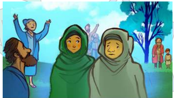
The story of Ruth and Naomi The Book of Ruth:

The Bible says that God is love, which makes the Word of God the perfect source to know what love means and how we can be loving people.